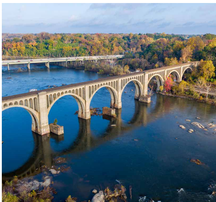
From top: The James River flows through downtown Richmond, Virginia, James River Railway Bridge, Page 2: Field Trip, Poster Session, Page 3: Presentation, Rafting Field Trip