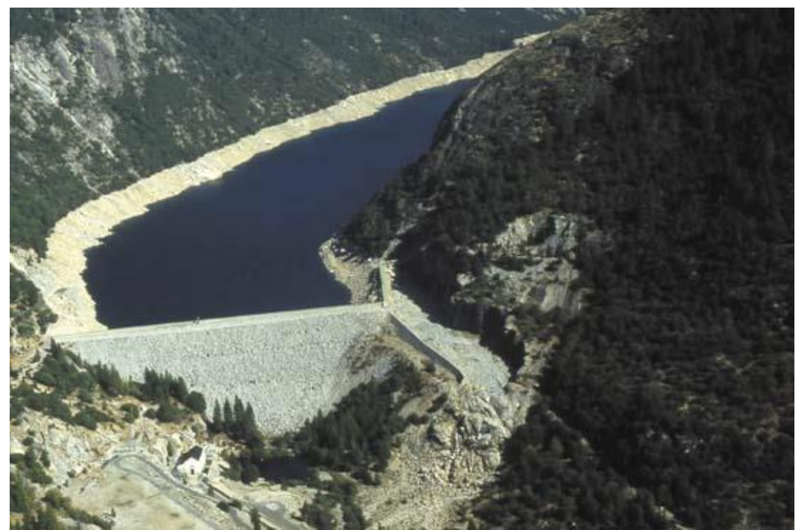
Salt Springs Dam on North Fork Mokelumne River

MOKELUMNE RIVER HYDROELECTRIC PROJECT (P-137)